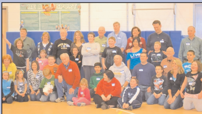
Mentor Program participants gather at the "Minute to Win It" event held at the Louis Toffolon School in January.